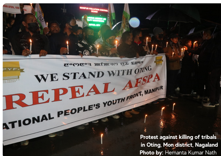
Protest against killing of tribals in Oting, Mon district, Nagaland

The IRAC intervened in these cases to ensure justice, claim reparation for the victims and their families, and to establish accountability by punishing the culprits to reduce, if not to eradicate impunity. At least 27 235 Indigenous Peoples are direct beneficiaries of these 77 cases.